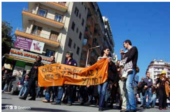
An anti-austerity march in Athens

This crisis is not simply fiscal; it is the reflection of an unsustainable development paradigm which is based on overconsumption and results in an ever increasing ecological deficit. The imposed corrective measures implemented in a state of panic and explained to a deeply skeptical public as a solution to the economic downturn are narrowly-conceived economic fixes based on highly questionable assumptions. Often their effect is simply to aggravate a longer term and much deeper crisis, with profound ecological, humanitarian and economic dimensions.